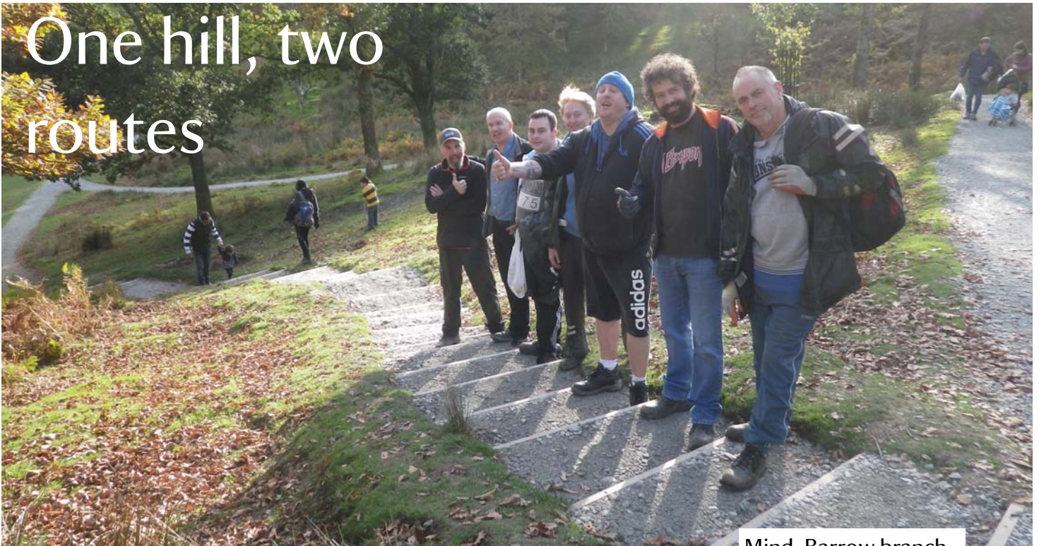
Mind, Barrow branch

The path up the hill from the lakeshore towards Wray castle wasn't really working out; too steep for buggies and wheelchairs and too tempting to cut the corners for those on foot. The solution? Two paths - one taking a longer and less steep route, with a more direct stepped option for walkers. Now everyone can get down to the beautiful shores of Windermere with ease!