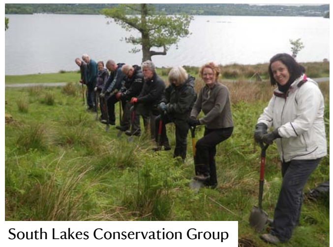
South Lakes Conservation Group