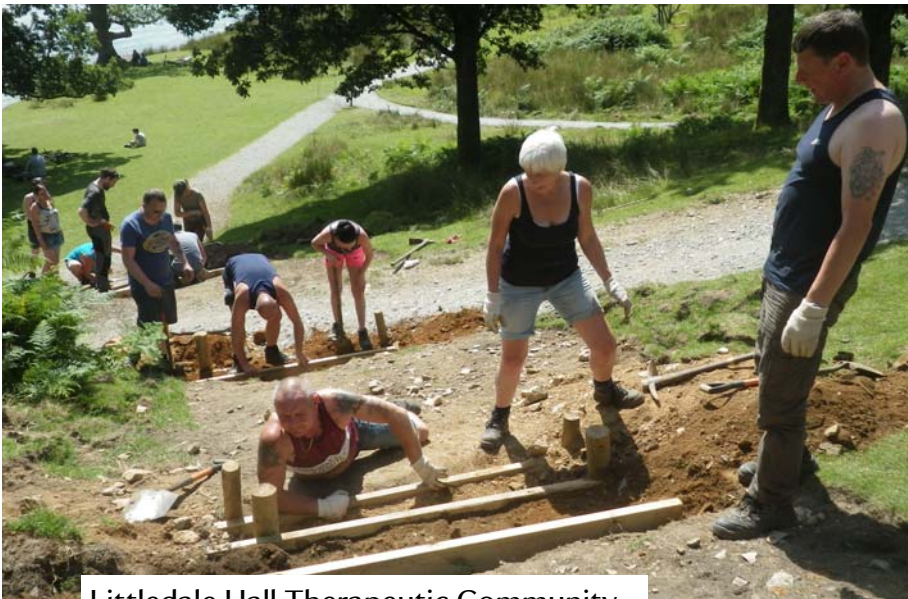
Littledale Hall Therapeutic Community

The path up the hill from the lakeshore towards Wray castle wasn't really working out; too steep for buggies and wheelchairs and too tempting to cut the corners for those on foot. The solution? Two paths - one taking a longer and less steep route, with a more direct stepped option for walkers. Now everyone can get down to the beautiful shores of Windermere with ease!