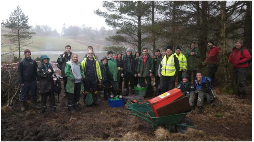
'I undertook tasks I never done in my whole life, tree felling, bonfires to burn the dead wood, clearing areas of the forest and by Tarn Hows. It was an amazing enjoyable experience and lots of hard work however it was fantastic' 'I am in awe of it all. This experience has shown me that if you believe in yourself and challenge yourself anything is possible. If I can stand and cut down a tree, be in charge of the cutting (felling) and the direction it falls, peoples safety, I can and will take on new challenges' Mulberry Community Project volunteers