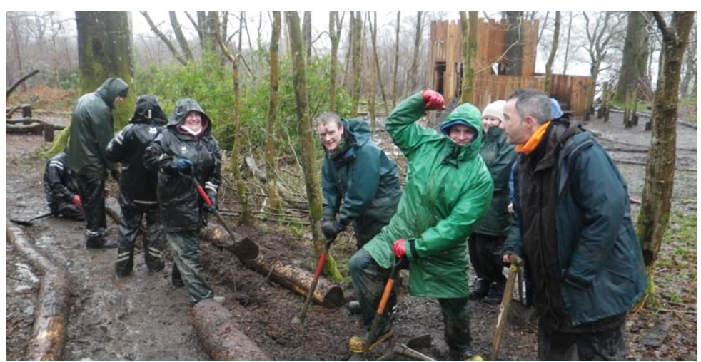
'Learnt I am a team player and encourage others and realised how beautiful our countryside is. I've learnt it were the drugs that made me sad in the past, not working in the rain' This week has been a fantastic experience, feel proud to have helped build something worthwhile. Great experience, proud and privileged' Shardale volunteers