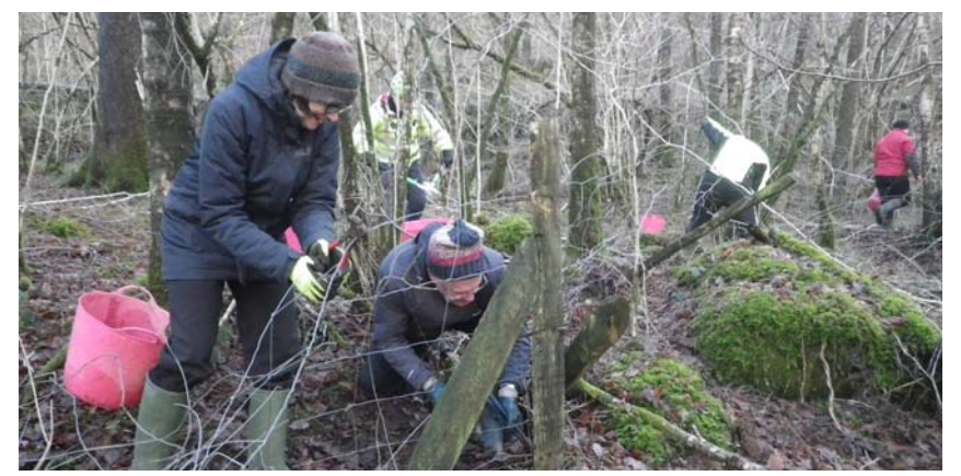
South Lakes Conservation group joined forces with students from Ambleside university for a fence removing mega day

Just being part of it and knowing that you've actually done something, cos when you come you look at it and it's beautiful and you think its automatically like that until you come to Basecamp and you realise what the rangers do and the volunteers do, what goes on' Littledale Hall Therapeutic Community volunteer