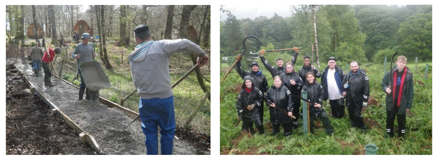
'It makes you feel positive and good about yourself and you've actually done something you can show your kids in the future if you bring them, I was part of this, I helped do it' Littledale Hall Therapeutic Community volunteer

As ever, 2017 saw us take on plenty of other jobs with the help of volunteers. Whether building a new walkway and tent pads at Low Wray campsite or bashing bracken around young tree plantings, continuing with the path improvements at Blawith Common or removing spruce regen at Nor Moss, helping weed and compost the beds in the Basecamp garden or clearing the arboretum at Fell Foot park there has been no end to the variety of jobs volunteers have turned their hands to.