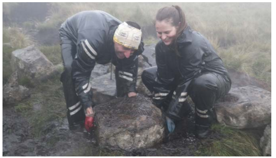
'I have learnt about persevering in the face of continual driving rain, cold, mudslides, working with cold hands under 8" water etc etc and I loved it!' Upland footpath working holiday participant

This year our working holidays spent their last day on a 'drain run' with the Fix the Fells volunteers. A great way for them to find out more about the work that goes into looking after the paths after they've helped to build them.