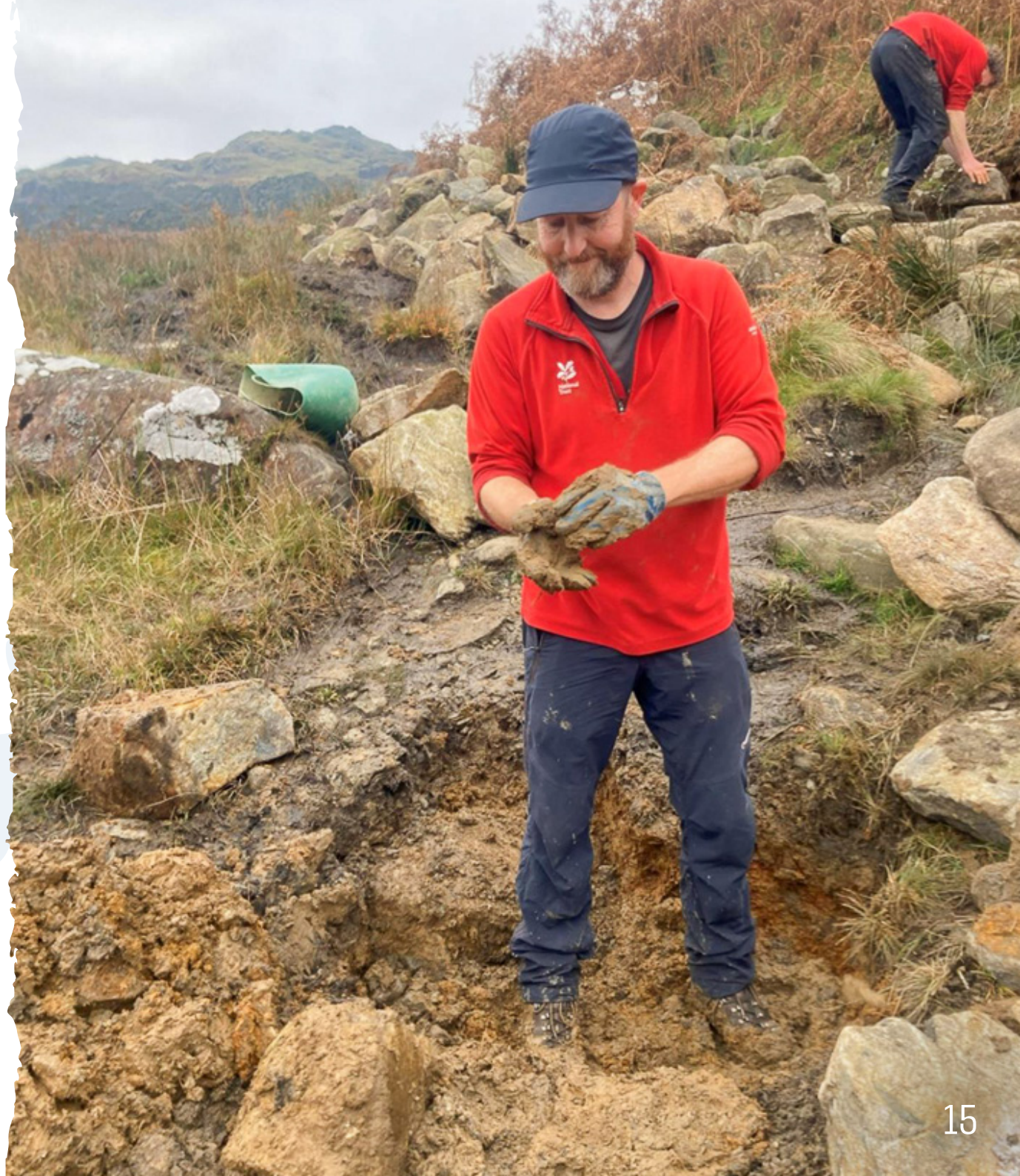
Photo: Ranger working Stythwaite Steps

Scan here to support our work with a donation