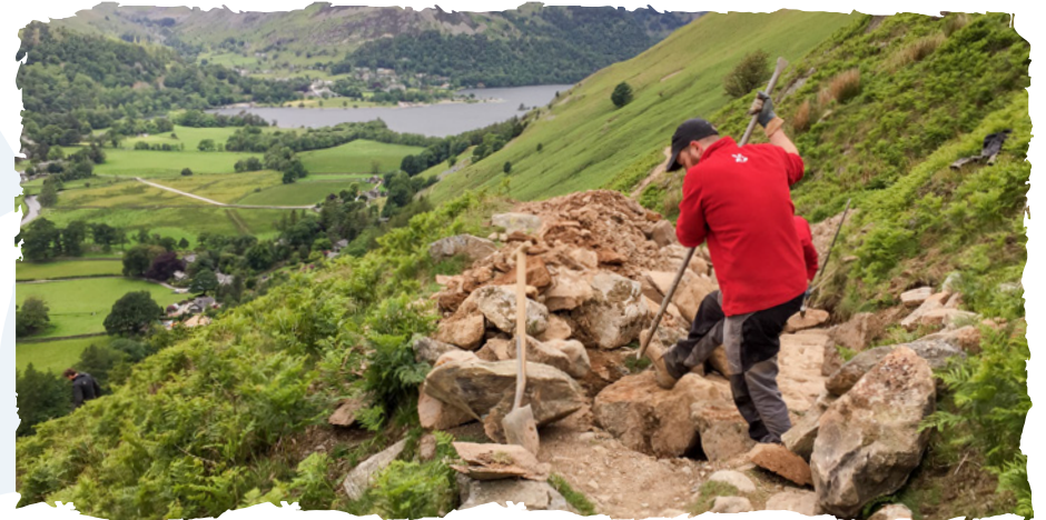
Rangers working in mud, Angle Tarn, 2024 (above), and rangers working Boredale Hause bridleway