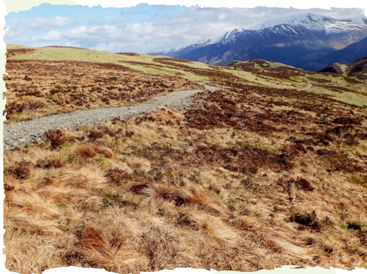
Barf, Whinlatter before and after 2023