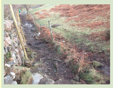
The narrow muddy path

A foray into Buttermere will give us a bit of variety this summer where we will be repairing a section of the Scarth Gap route damaged by Storm Desmond. This will probably be in late summer as we have to wait till after the nesting season on Haystacks before we can fly in stone.'