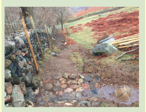
The drier wider path